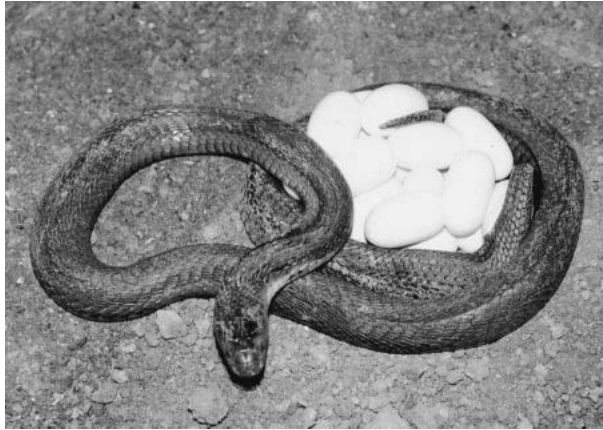
Figure 2. A Siamese cobra with a clutch of eggs.

rate) after 57 to 63 days of incubation. However, one entire clutch of 8 eggs became infected with fungus.